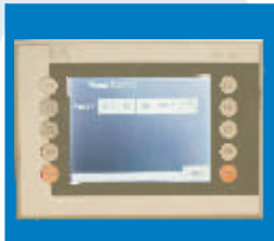
Touchscreen panel for easy operation control