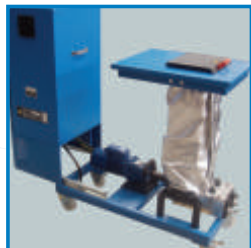
Easy access for maintenance