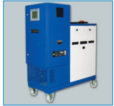
Caster available for easy mobility.