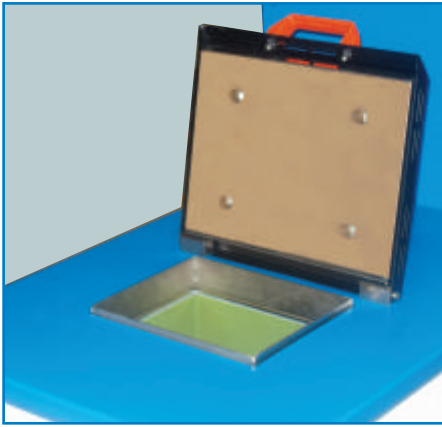
Large tank opening with easy access for filling and maintenance.