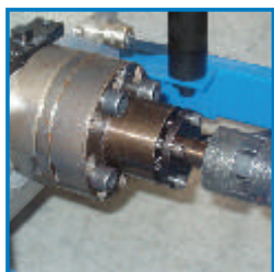
HS compatible pump to ensure stability in performance

PLC based control technology connected to your production lines network