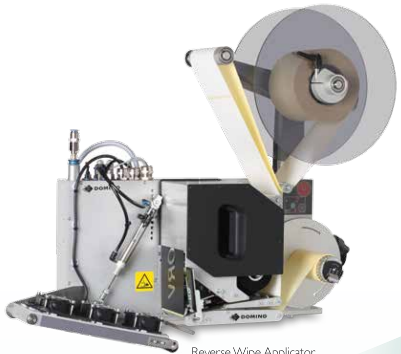
Reverse Wipe Applicator