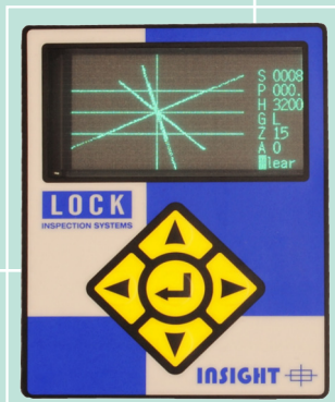
DDS (Direct Digital Signal)