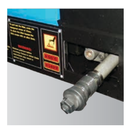
Filter with pressure discharger