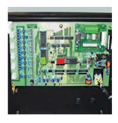
Optional RS485 connection with modbus protocol